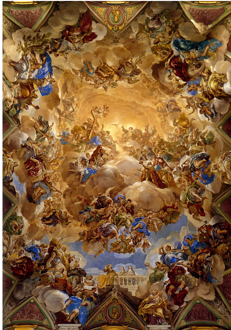
"La Gloria" by Luca Giordano

For over one hundred years, the Spanish legitimist movement was characterized by its strong political views and consistent opposition to the policies of the Court in Madrid presided by Ferdinand's descendants. Carlism never gained power, but Spain's major tradition-